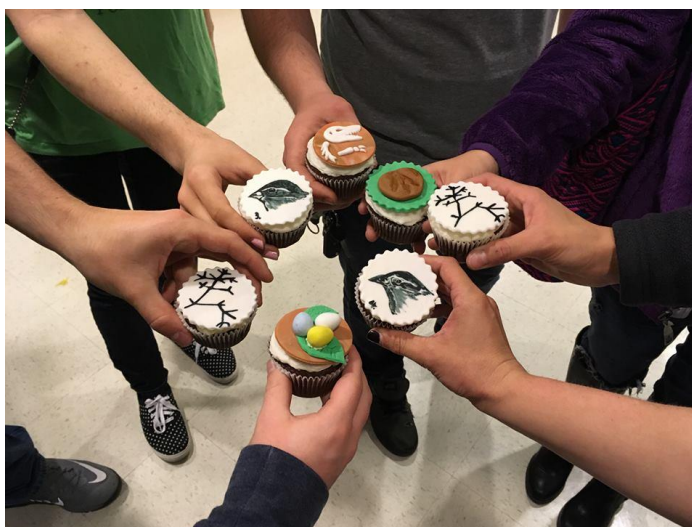
Figure 3. Evolution-themed cupcakes donated for UNCW's 2017 Darwin Day.

To educate attendees, we invited participants to give 5-minute “lightning talks” that connected their discipline or research to evolution. To increase student engagement between each talk, we posted a multiple choice trivia question. Students were encouraged to develop creative trivia team names. Team responses were collected after every round and tallied for final prizes. We revealed the answers at the end of the event. This event provided a diversity of viewpoints and epitomized the spirit of the event. This approach created a low-risk interdisciplinary event that achieved the a priori goal of engaging non-science majors. Overall, we had 150 students and faculty members in attendance.