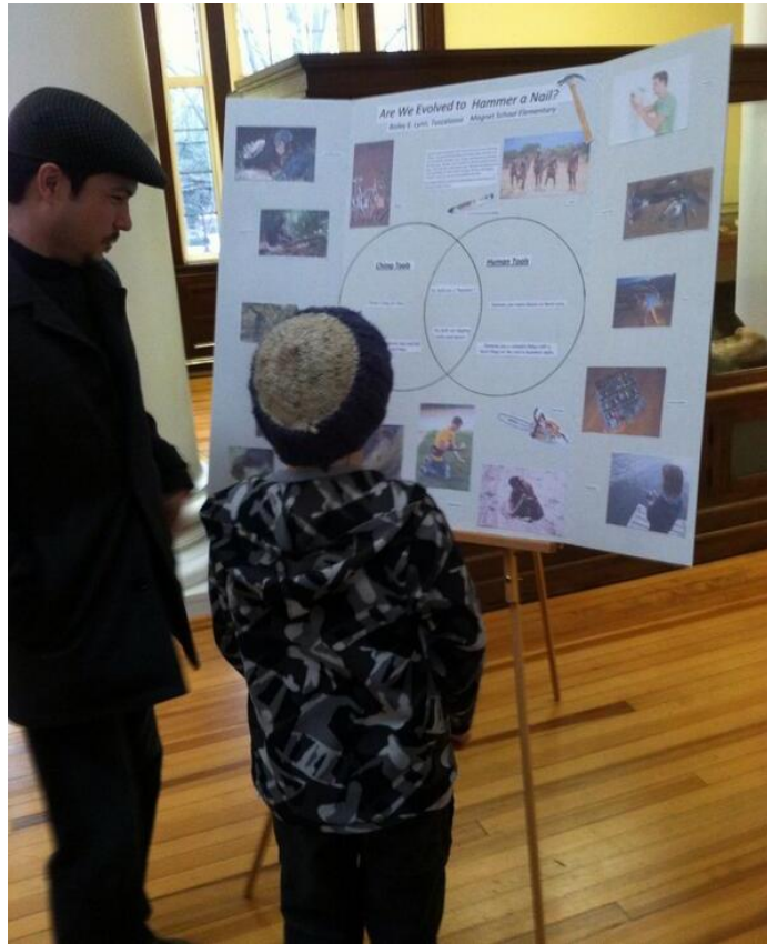
Figure 5. Local 6 th grader presenting evolution poster at UA's 2014 Darwin Day Research Colloquium.

As the programs at GVSU and UNCW make clear, a half-day event of faculty and student presentations, activities, and Darwin-centric discussion provides a low-stakes opportunity for students to sample this information. Starting a Darwin Day event might seem like overkill for a school with an EvoS program. However, since there are new members of a university or college town every year, what may seem repetitious for those teaching evolution and hosting events often remains novel and profound for students and other community members. Most students arriving at UA and similar college campuses have no background in evolution and few opportunities to get exposure (Schrein, 2017). A 2014 study conducted at UA found that the majority of undergraduates who arrive have already decided whether they will be inclined to take a course about evolution or not (Rissler et al., 2014). As a result, these students are unlikely to attend evolution-themed events unless joining friends, receiving extra credit, or exposed to the event through purposeful, creative marketing.