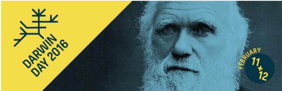
Figure 1. Example of promotional material for GVSU’s Darwin Day event.

The GVSU planning committee was ambitious and made Darwin Day a university-wide event. To avoid limiting the appeal to the “science-minded,” we selected a planning committee that included science (biological anthropology) and non-science disciplines (art and library studies). The art and library members of the committee brought a necessary non-science perspective to our celebration via an evolution-themed art exhibit and polished, eye-catching promotional materials, such as posters, pins, and mugs, in addition to ideas that would appeal to a broad base (Figure 1). There was also a web based photo montage of “Darwin’s Journey to GVSU” that followed a plush Darwin from his home in England to his party in Michigan (Figure 2).